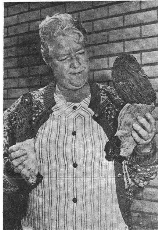
THE BREMERTON (Wash.) SUN Wednesday, May 17, 1972

Beautiful weather Friday and Saturday, rained all Saturday night, but the sun came out Sunday. Wonderful cooperation from all PSMS members.