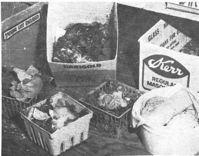
SATISFACTORY METHOD OF COLLECTING FOR SHOW

You also should have along larger boxes, for the larger specimens and for carrying the smaller containers. Boxes which can be nested or stacked are convenient for getting fungi back. You may also want to use wax paper bags for fungi needing special care. If you want any of your containers back, please mark them clearly with your name and phone number.