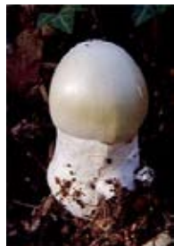
A young Amanita phalloides emerging from its universal veil.

Times may be changing. Currently, several major universities have staff and graduate students working on projects to determine the spread of ectomycorrhizal fungi to novel sites around the world. Some ectomycorrhizal fungi, such as truffles and Pisolithus tinctorius , have been used as inoculants on roots of seedling trees to increase their rate of growth or to produce an important commercial crop. These intentional plantings of trees and fungi have rapidly increased the spread of exotic fungi to new locations. These sites are now the focus of research by ecologists trying to learn what impact introduced fungi have on the habitat, and to determine if the fungi will, or have, become invasive.