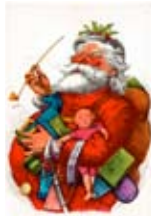
St. Nicholas by Thomas Nast, 1881

Santa's description as a portly, jolly old elf who traveled by reindeer-led sleigh originated in the poem "A Visit from St. Nicholas," written in 1822 by Clement Moore. The poem created a popular icon and in 1881, Thomas Nast, a political cartoonist, drew on Moore's poem to create the first likeness that matches our modern image of Santa as a rotund, cheerful man with a full white beard and bright red suit trimmed with white fur.