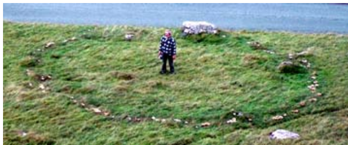
Wales fairy ring.

AS part of the very first Wales Fungus Day—which is being held at the National Botanic Garden on Sunday—there is a nationwide search for Wales’s largest fairy ring.