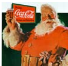
Coca-Cola ad, 1931

Santa's red and white suit became the accepted norm only a century ago after an ad campaign by Coca-Cola featuring Santa drinking a Coke. Coca-Cola ran an ad with Santa wearing their colors in 1931. Red was a popular Santa color in the early 20th century, but red and white together was due to Coke's advertisements.