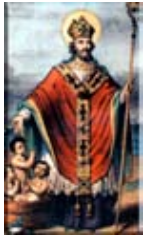
St. Nicholas of Myra

A popular belief is that Santa Claus is a folk memory of Siberian shamanism related to Amanita muscaria . Santa's red and white costume represents the Fly Agaric's color; flying on a reindeer-driven sleigh relates to mushroom-induced intoxication. Santa's entry via the chimney is thought to stem from the idea that shamans entered yurts through the smoke hole, wearing red and white fur trimmed coats and long black boots. His appearance, clothing, and companions suggest a connection to ancient mushroom-gathering shamans.