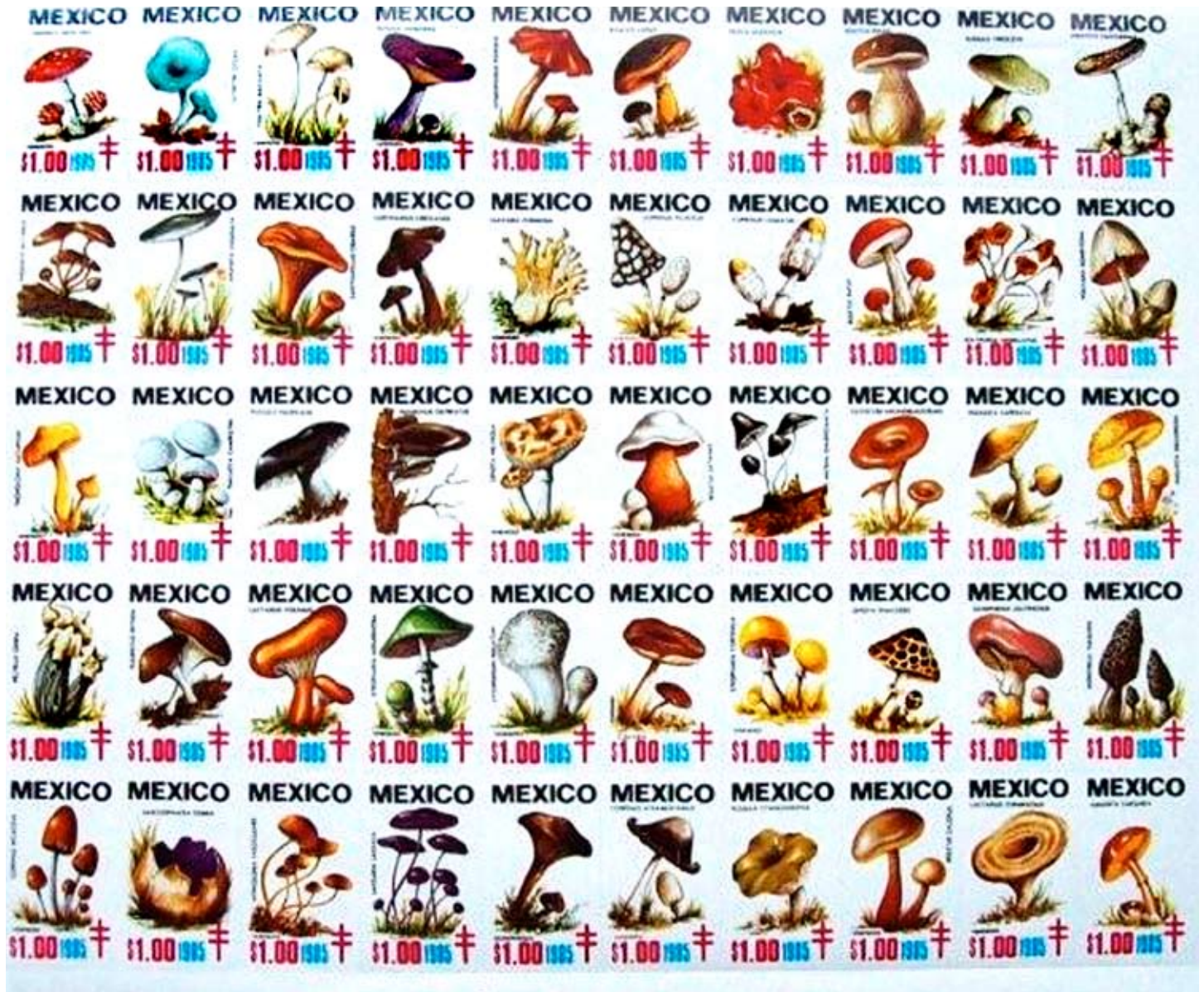
Mexico, 1985, TB seal sheet of 50 different mushrooms.