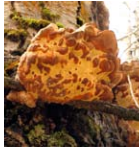
Laetiporus gilbertsonii growing on an aspen tree

MushRumors , Ore. Myco. Soc., Jan./Feb. 2013