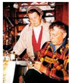
Valentina Pavlovna R. Gordon Wasson