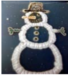
Snowman made by combining four different fungi, including common strains such as Aspergillus niger and rarer ones such as Penicillium marneffeii .

Different fungal grow at different rates, so Mounaud’s artwork rarely lasts for long. There’s only a short window of time when they actually look like what they’re suppose to. “You do have to keep that in perspective when you’re making these creations,” she said.