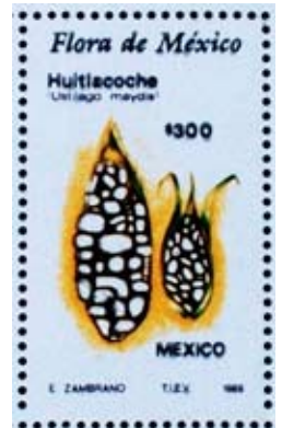
Scott 1577, corn smut