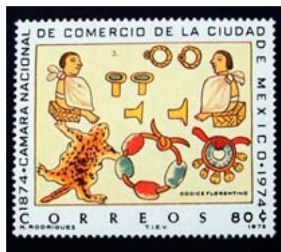
Scott 1085. Florentine Codex