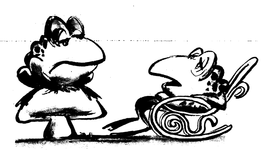
"For years I had a low-grade backache and I finally discovered it was that damn stool."

New Heading for Bulletin - Send artwork ideas to editor.