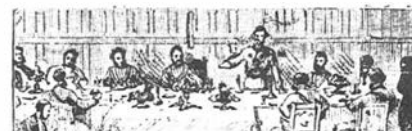
THINK SURVIVORS BANQUET

BULLETIN OF THE PUGET SOUND MYCOLOGICAL SOCIETY 2559 NE 96th, Seattle, Washington, 98115