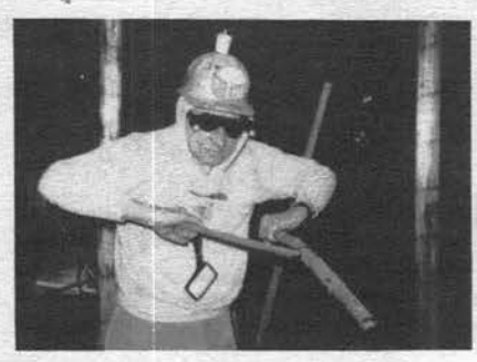
Prospecting at the Lirpa Loof truffle mine.