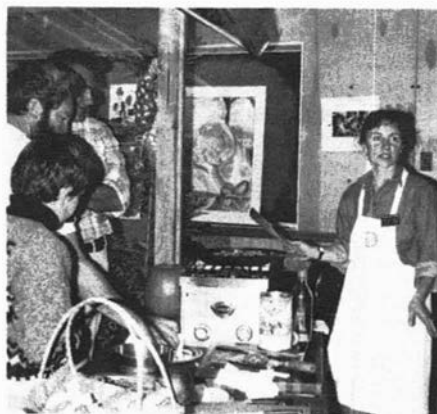
Mushroom tasting, Annual Exhibit 1989