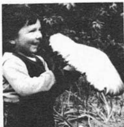
Fungus Perfecti, Jr.

[ Mush Rumors , Newsletter of The Oregon Myco. Soc.]