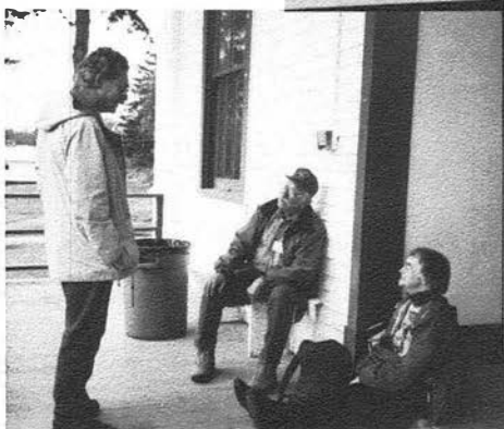
▲ Attendees from different states renewing acquaintance