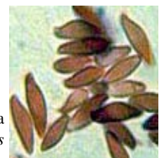
L. magnispora spores