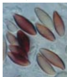
L. clypeolaria spores