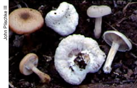
Normal (left) and parasitized (right) Armillaria mellea