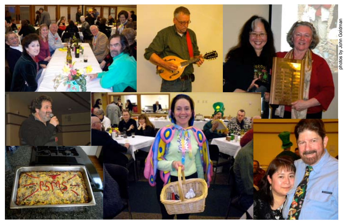
PSMS Survivor's Banquet, March 13, 2010