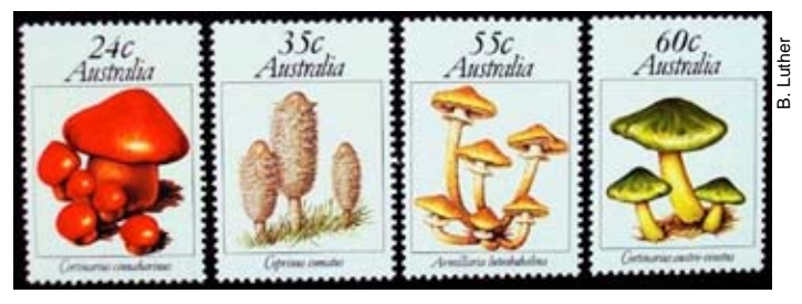
Australia 806-9, 1981.