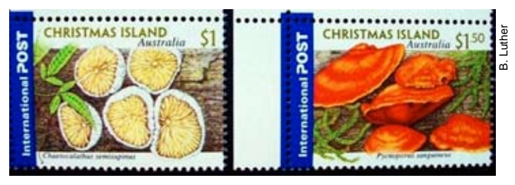
Christmas Island 432-3, 2001