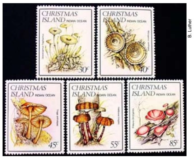
Christmas Island 152-6, 1984