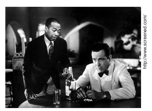
"Of all the gin joints in all the world, she walks into mine." Rick's Lament," Humphrey Bogart in "Casablanca."

Gin drinkers of the world unite! Fight back against Phytophthora ! As a side benefit, the sooner you stamp it out, the sooner you won't have to pronounce it.