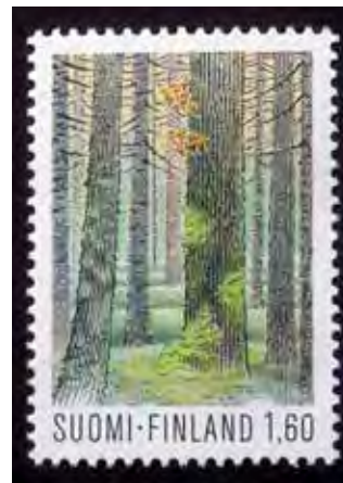
Scott 634 (663).

This stamp commemorates Multiharju Forest in Seitsemien National Park. Under magnification I count 19 or 20 mushrooms high up on a conifer tree trunk. They appear to be a species in the genus Pholiota , but this can't be determined with certainty. The 2011 Scott Postage Stamp Catalogue lists this stamp as No. 634, but the exact date of issue is not specified; in fact, the year is also unclear, which is highly unusual. Gerlinger (1991) lists this stamp as Scott No. 663 and gives the date of issue as February 8, 1982. Weber