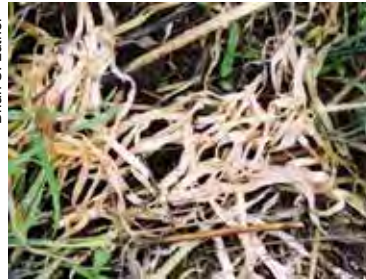
Close up of Pink Snow Mold showing both parasitized and unparasitized grass blades from the previous year.

There's a wealth of information online concerning this fungus, especially as it relates to maintaining healthy lawns and turf. A lot of the information presented on Pink Snow Mold deals with measures to prevent it and effective fungicides to combat it. It's an unwelcome infestation, and what home owners really care about the most is controlling its spread for appearance.