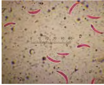
Photomicrograph of macroconidia of Microdochium nivale , 1000×, 3% ammonium hydroxide and Phloxine.