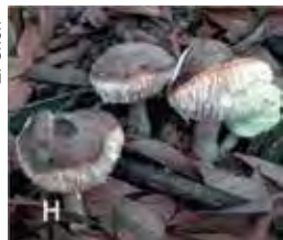
Russula subnigricans . 2

struggling with Russula identification; many people have misidentified this species and eaten it. One study reports that it caused a quarter of the 852 mushroom poisonings in the past 18 years in Southern China. Half the people who ate it died!