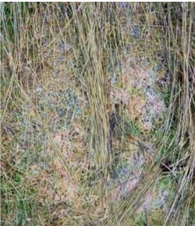
Several square feet of Pink Snow Mold in field.

A major factor in its development and spread on turf grass appears to be the late summer use of nitrogen fertilizers (Dickson, 1947). Although growing primarily on living grass, it also grows on blades of dead grass from the previous year. It's common here in the Pacific Northwest but is more of a problem in the Mid-West and East, where the winters are colder and longer and the snow pack lingers. According to Dickson (1947) this fungus is particularly a problem in areas where the snowfall is heavy and the soil temperatures are mild.