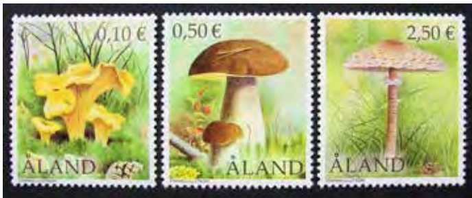
Scott 194, 197, 200.

These three stamps are not labeled with scientific names, so I've provided them. FDCs were issued for this set, with the cachet showing a full mushroom basket on the left and having either a Chanterelle or a Boletus cancel. Postcards (maxi-cards) were also issued showing photographs of the same species, with the stamps having a Boletus first day cancel as well.