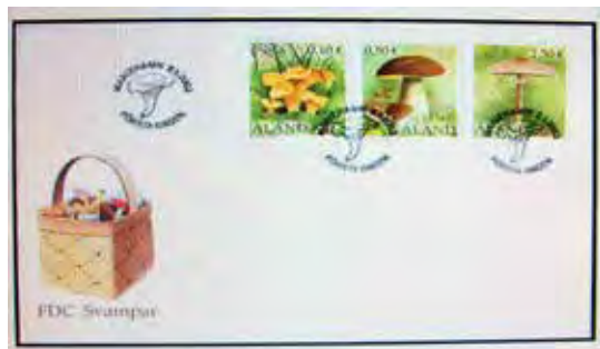
FDC for Scott set 194, 197, 200.

These three stamps are not labeled with scientific names, so I've provided them. FDCs were issued for this set, with the cachet showing a full mushroom basket on the left and having either a Chanterelle or a Boletus cancel. Postcards (maxi-cards) were also issued showing photographs of the same species, with the stamps having a Boletus first day cancel as well.