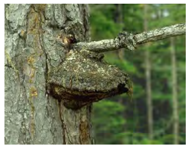
Indian Paint Fungus, Echinodontium tinctorium.

If you run across any, please call or email me at 206-522-1051 or a2zluther@comcast.net.