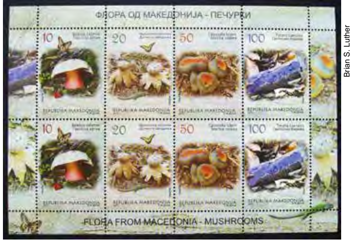
Macedonia, 2013 - mini-sheet of four values x 2. Terana caerulea is the 100-value stamp on the right.

As you can see from the photo, the mini-sheet with these stamps is quite colorful, having two sets of the four stamps and also showing the same fungi on the selvage (non-stamp margin).