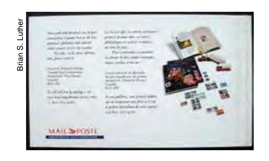
Back of booklet for Scott 1272 & 1273 (see text).

The next item from Canada Post showing fungi is a booklet titled "Moving the Mail. The Story of Canada's Postal System." Only the back cover of the booklet shows fungi, a small picture of the "Souvenir Collection of the Postage Stamps of Canada 1989" (mentioned in the previous paragraphs). The left-hand page shows the four-value mushroom section, with separate mushroom illustrations and text; the right-hand page shows the four value set by itself, as well as the same set shown separately below. Because this single booklet contains two different stamps, the Scott Catalogue has given it two numbers (see table) although the stamps themselves do not show any fungi.