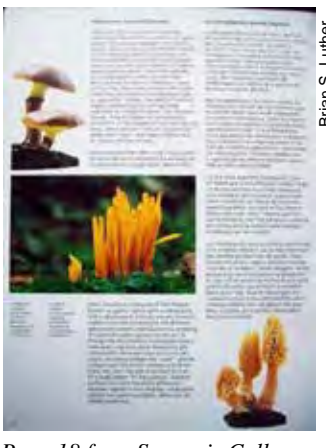
Canada 1989 book.

In addition, a 42 page book was issued by Canada Post titled Souvenir Collection of the Postage Stamps of Canada 1989 with all the stamps in it and a lot more text and illustrations relating to the issues from that year. Page 18, titled "Mushrooms: Fascinating Fungi," has photographs of some of the fungi that are on the set of stamps. Unfortunately the photograph of the bolete shows two basidiocarps of Suillus luteus (Slippery Jacks), not Boletus mirabilis—oops! It's clear that they failed to consult Page 18 from Souvenir Collecwith a mycologist on the ID here. tion of the Postage Stamps of