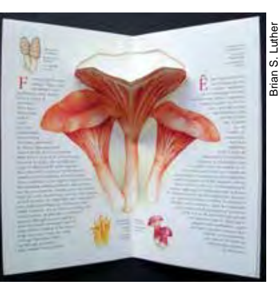
Inside of presentation pack for Scott 1245-48 with pop-up Cantharellus cinnabarinus.

Canada Post also issued Images No. 1 , a book describing in greater detail all of the stamps issued in 1989. The cover has a beautiful illustration of Loratiomyces squamosus var. thraustus