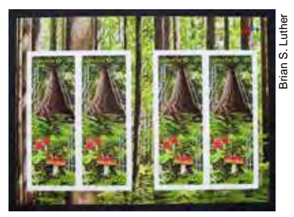
Inside of booklet Scott 2463a with eight stamps.