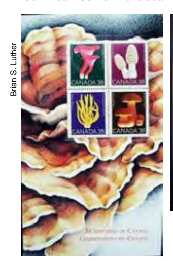
Cover of presentation pack for Scott 1245–48, with Trametes versicolor.

In the presentation pack issued for this set, the four stamps are mounted in a clear sleeve, with the entire cover featuring Trametes versicolor on both the front and the back. Although this polypore is the main illustration on the presentation pack, it is not on any of the stamps in the set. When you open the presentation pack, titled "Mushrooms of Canada," a cute illustration of Cantharellus cinnabarinus pops up, like you'd find in a children's book. Two different FDCs were issued for this set as well. The first has all four stamps on a single envelope (cover); the cachet shows a morel and the bolete along with microstructures of each; the cancel shows a Death Cup Amanita with three maturing basidiocarps as seen in longitudinal section (egg button stage, half grown, and mature). The other FDCs show each of the four individual stamps on separate envelopes, with the same cachet and cancel just mentioned. Also, the back side of the FDC tells all about each of the four mushrooms in the set.