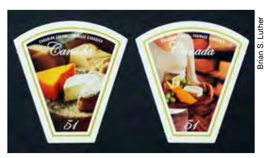
Scott 2170 & 2171 showing moldy cheeses (see text).

The third postal item with fungi is the right front outside cover of Canada booklet 2171a, which shows a round of cheese covered with mold, on which is a smaller wedge of yellow cheddar. The mold growth is obvious and is most likely Penicillium roquefortii or Penicillium camembertii, the two common species growing on and flavoring cheeses. The variety of cheese is not specifically mentioned, however, so we don't know for sure. The two stamps (2170 & 2171) are photographs designed and shaped to appear like cheese labels. All these stamps are die cut and self-stick.