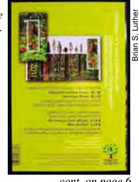
cont. on page 6

Scott 2461 is the souvenir sheet (s/s); it shows a continuous scene of the two stamps together. The Douglas Fir stamp (2462) towers above; below it is the Amanita muscaria stamp (2463). The actual Amanita stamp shows three basidiocarps; two more mushrooms of the same species are shown next to these in the overall illustration but