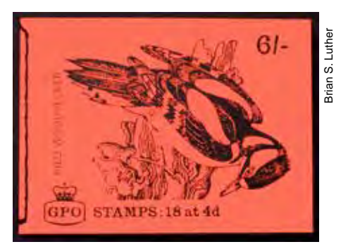
Booklet cover, BK115.

The cover of booklet BK115 shows a Pied Woodpecker, but has a polypore conk beside it growing on the tree, which is stylized and not identifiable to species.