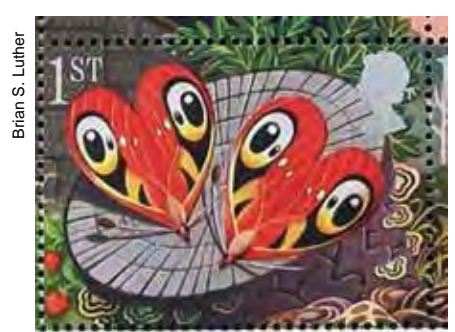
Scott 1358, with Trametes versicolor

Scott 1358 shows a stump with two Peacock Butterflies and a stylized fungus with zonate pilei growing all around it. According to the 2011 Scott Catalogue the insects are "Peacock Moths," which is