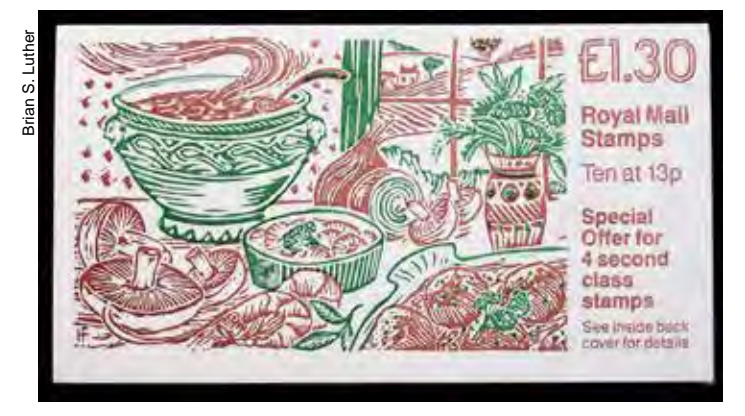
Cover of booklet BK532.

Scott BK532 booklet cover shows a scene of food in a kitchen, with five stylized edible mushrooms on it. This booklet is titled "Recipe Cards" in the catalogs, and the stamps inside have no fungal illustrations—the mushrooms are only on the booklet cover.