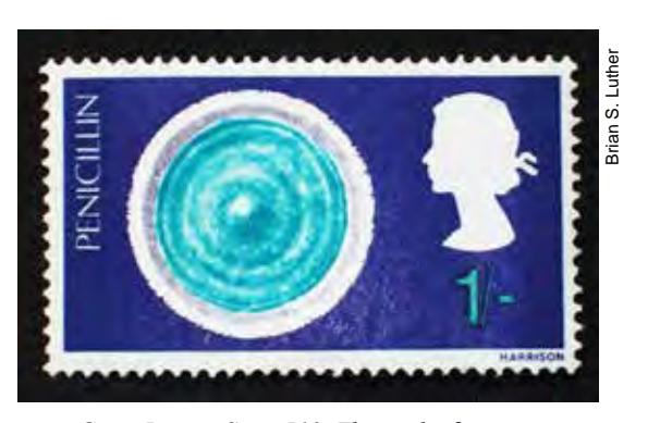
Great Britain Scott 519. This is the first stamp to commemorate penicillin, in 1967.

Four of the stamps listed in different sets in the table below show Penicillium spp. on them. Scott 519 shows a Petri plate culture of the fungus used to extract the antibiotic from and is the very first postage stamp ever issued commemorating penicillin, in the year 1967. It is also the first British stamp with a fungus as the main illustration. Coincidentally, the first postage stamps issued from both Great Britain and the United States (Luther, 2014) that have fungi as the main illustration show penicillin mold ( Penicillium