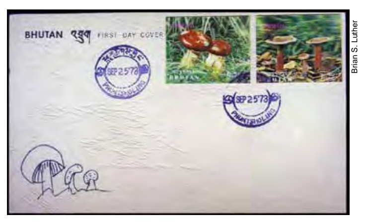
Bhutan 1973 FDC.