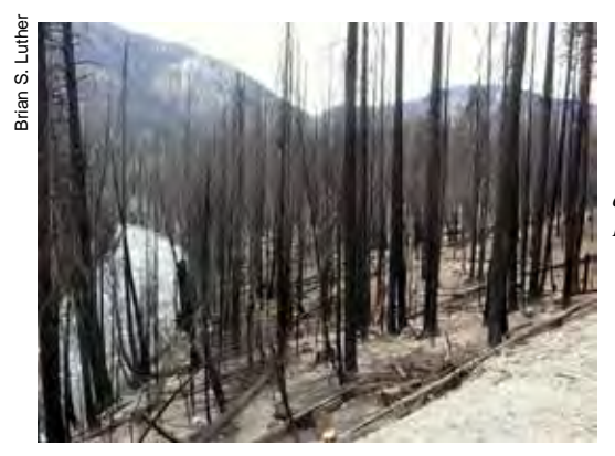
Wolverine fire area. Entiat River at left.

A delightful potluck at about 5:30 pm was enjoyed by a hungry group of mushroom hunters. We had a great selection dishes, along with growlers of beer, and I can tell you that everybody was satisfied. Most members were spending another night at this shelterless location either in their tents, campers, or cars. Just at the end of potluck, about 6:30 pm, it began to rain, but this in no way dampened our spirits after such a fun, successful day.