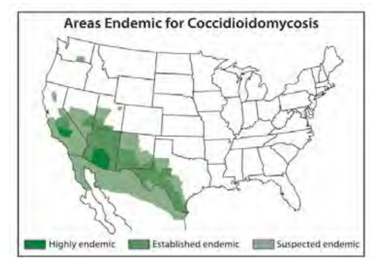
Areas endemic for coccidiodomycosis (aka Valley Fever) in the U.S. The fungi that cause ValleyFever—Coccidioides immitis or Coccidioides posadasii—are also endemic to parts of Central and South America, areas with mild winters and arid summers. Their spores are extremely small and can be carried hundreds of miles by the wind. Once inside the lungs, the spores reproduce, perpetuating the cycle of the disease.