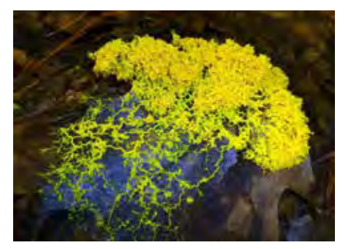
Physarum polycephalum on the move. As it eats, it grows, seeking out new food sources.

To find out, scientists at Toulouse University in France tested slime molds' behavior in the lab, focusing on a very basic form of learning: habituation, when a living thing's behavioral response decreases to a repeated stimulus—whether good or bad—over time.