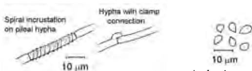
Arrhenia acerosa , hyphae.

Microstructures: pileipellis (skin of the cap) a semi-gelatinous cuticle of radially arranged hyphae; hyphae 4–12(15) μm wide, thin-walled, hyaline (colorless in clear mounting media) individually, but brownish in mass due to pigmentation, with septa (crosswalls) and clamp connections abundant, but some have septa and no clamps, occasionally branched, with some of the uppermost (surface) hyphae having distinct spirally arranged pigment or hyphal wall striations, thickenings, or incrustations; contextual hyphae similar but without spiral incrustation, irregularly arranged and more highly gelatinized with abundant irregular refractive crystalline material throughout; cystidia none; lamellar trama (tissue) similar to contextual tissue; basidia 20–30 × 4–6 μm, clavate, and four sterigmate; basidiospores 6–7.5 × 4.5–5 μm, broadly ellipsoid to ellipsoid and lacrimiform (tear-drop shaped), smooth, hyaline (but white in deposit), thin-walled and inamyloid (no color change in Melzer's reagent or IKI).