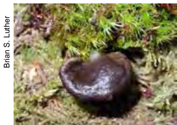
Arrhenia acerosa , view of cap.