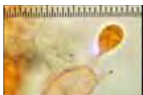
A. acerosa . Basidiospore on basidium at 1000×, mounted in 3% ammonium hydroxide & Congo Red.