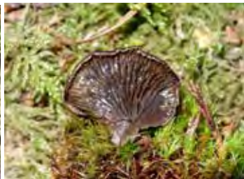
Arrhenia acerosa , view of gills.

Habitat: On moss in a mixed conifer forest of Douglas Fir ( Pseudotsuga menziesii ), Western Hemlock ( Tsuga heterophylla ), and Western Red Cedar ( Thuja plicata ). Arlington, WA. Sept. 24, 2016.