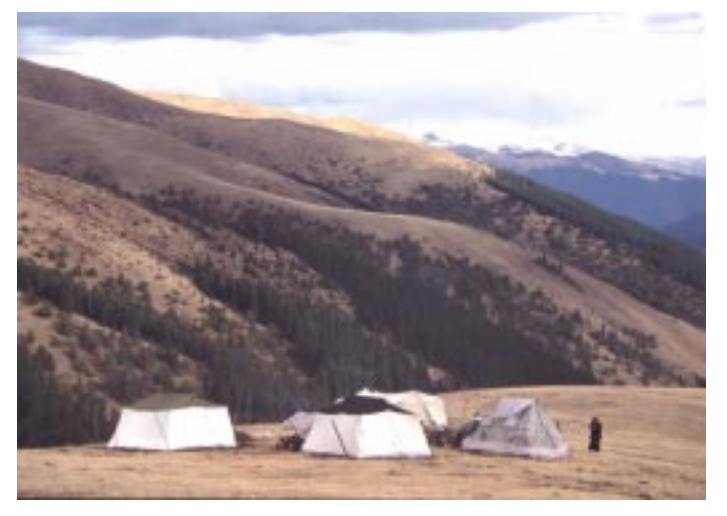
Yartsa hunters' camp

diarrhea, hallucinations, and possibly lethal gangrene. And while consuming Cordyceps sinensis will not provide any of these symptoms, eating a caterpillar fungus specimen might well cause disgusted retching in some faint western souls, owing to a lack of culinary appreciation of insect delicacies.