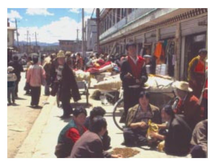
Yartsa market in Litang, Tibet

However, it is not only innocent ghost moths who become infested by Cordyceps , for apparently I too suffered an infestation. I won't claim that it is only Cordyceps that forces me to return to Tibet again and again, as it forces the moribund caterpillar to move to the place of its last rest, but my curiosity got seriously stoked. There seems to be no end to discovery when looking into such an elusive and complex—bordering on esoteric—organism endemic to one of the world's most remote areas.