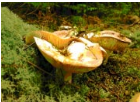
Russula crassotunicata in the spring

Like some kind of myco-zombie, this beast turns brown, rots, molds, and stinks to high heaven over a period of months. But it just never seems to go away. This persistence may be a key reason that this mushroom is an important host for some of our other fascinating