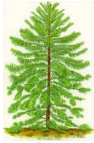
Wollemi pine Wollemi nobilis

"We understand that people are really keen to see the trees in their natural environment, but there are only a few dozen left and they are extremely vulnerable to infections so we're asking people to stay away," he added.