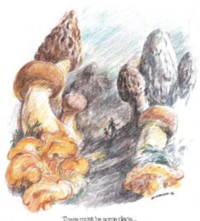
There must be some piece...

Bake Brie in middle of oven until pastry is puffed and golden, about 20 minutes. Let Brie stand in pan on a rack 15 minutes and transfer with a spatula to a serving plate. Serve with bread or crackers. Makes 8-10 servings.