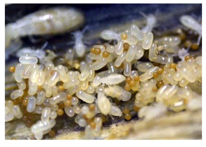
Termite egg pile incorporating sclerotia (round balls) of the crust fungus Fibularhizoctonia

Some termite species depend on Termitomyces , a genus of gilled mushrooms, for survival. The mushroom provides strong enzymes that change lignin and cellulose into food that the termites can digest. These Reticulitermes spp. don't need that help. They don't eat TMBs, and TMBs don't affect the survival rate of their eggs. So what does the fungus give to the termites in exchange for care, shelter, and transportation? Nothing.